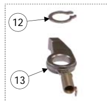
DETAIL, PAWL MOUNTING DIRECTION.