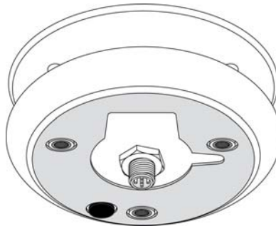
Figure 2 – WSO100 Interface Connector

The Maretron WSO100 provides a connection to an NMEA 2000 ® interface through a connector that can be found on the bottom of the device (see Figure 2).