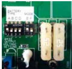
Selection of battery type and protection by removable fuses